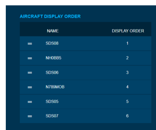
Aircraft Display Menu (click image to enlarge)

We will automatically apply the current display order from the Aircraft Profile to the new Company Profile Display Order Table. This means your fleet's existing display order will remain unchanged, saving you time and effort.